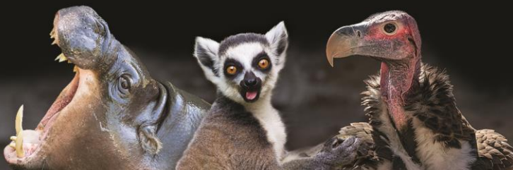
PYGMY HIPPO ENDANGERED

The foundation was founded in 1988 with the principle aim of ensuring the survival of cheetah and other endangered species. Our mission is to promote this through captive breeding, research and public awareness.